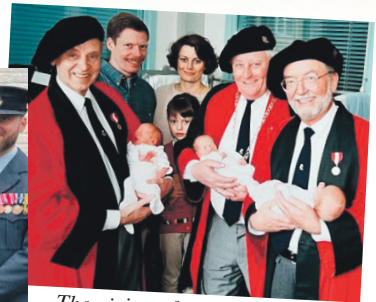
The giving of triplet prize in 1996