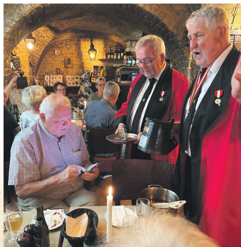
Det blev til mange herlige optagelser i 2023.